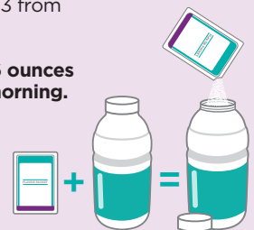
Bottles and packets not shown actual size.

IMPORTANT: Continue to consume only clear liquids until colonoscopy. Stop drinking liquids at least 2 hours prior to colonoscopy.