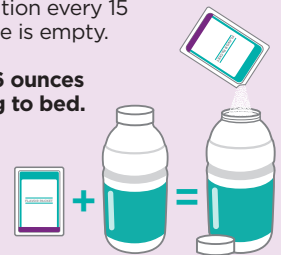
Bottles and packets not shown actual size.

IMPORTANT: If nausea, bloating, or abdominal cramping occurs, pause or slow the rate of drinking the solution and additional water until symptoms diminish.