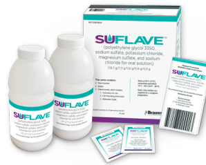
Bottles and packets not shown actual size.

To learn more about this product, please call 1-800-874-6756.